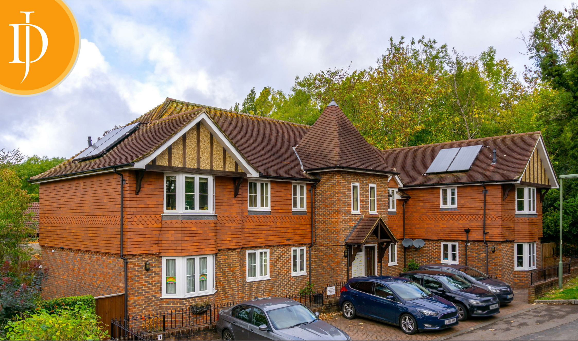
Flat 3, Morris Court South Station Approach, South Nutfield, Redhill, Surrey, www.jamesdeanproperty.co.uk